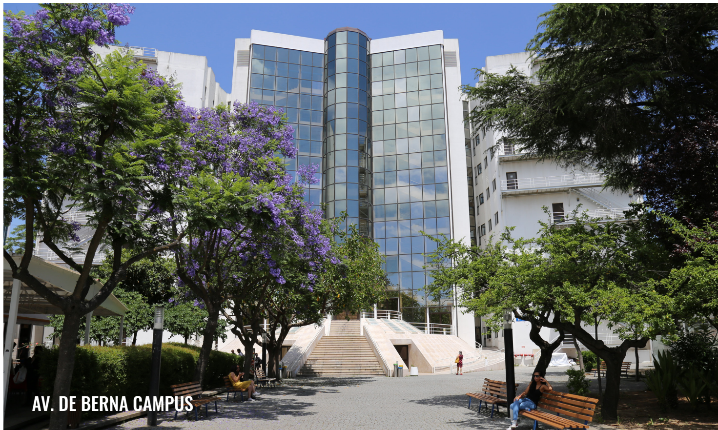
AV. DE BERNAL CAMPUS