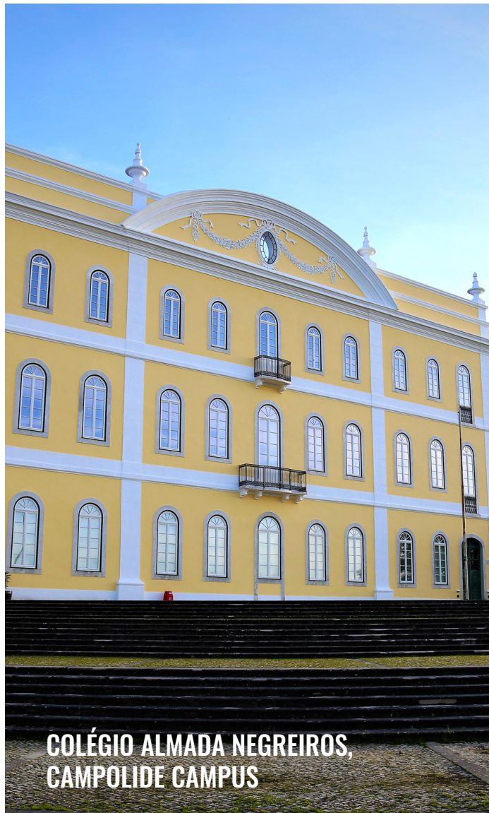
COLÉGIO ALMADA NEGREIROS, CAMPOLIDE CAMPUS