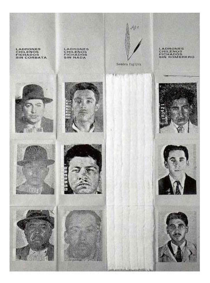
Pintura Aeropostal №50, Historia de la Indumentaria, 1986 Algodón y Fotoserigrafia sobre Papel de Envolver, 210 x 154 cm Itinerario: Santiado do Chile 86- Madrid 87 – Barcelona 87 – Sydney 87 – Lima 88 – Rotterdam 93/94 – Santiago de Chile 98 – Lisboa 98

Antropologia, Arte e Imagem | N°s. 5-6 (Nova Série) | 2009 Centro de Estudos de Etnologia Portuguesa