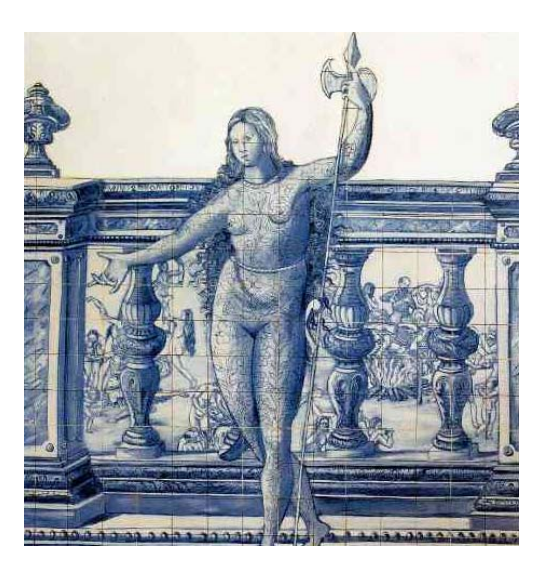
Figura de Convite, 1997 Oil on canvas, 200 x 200 cm Private collection, Miami

Adriana Varejão <sup>13</sup>