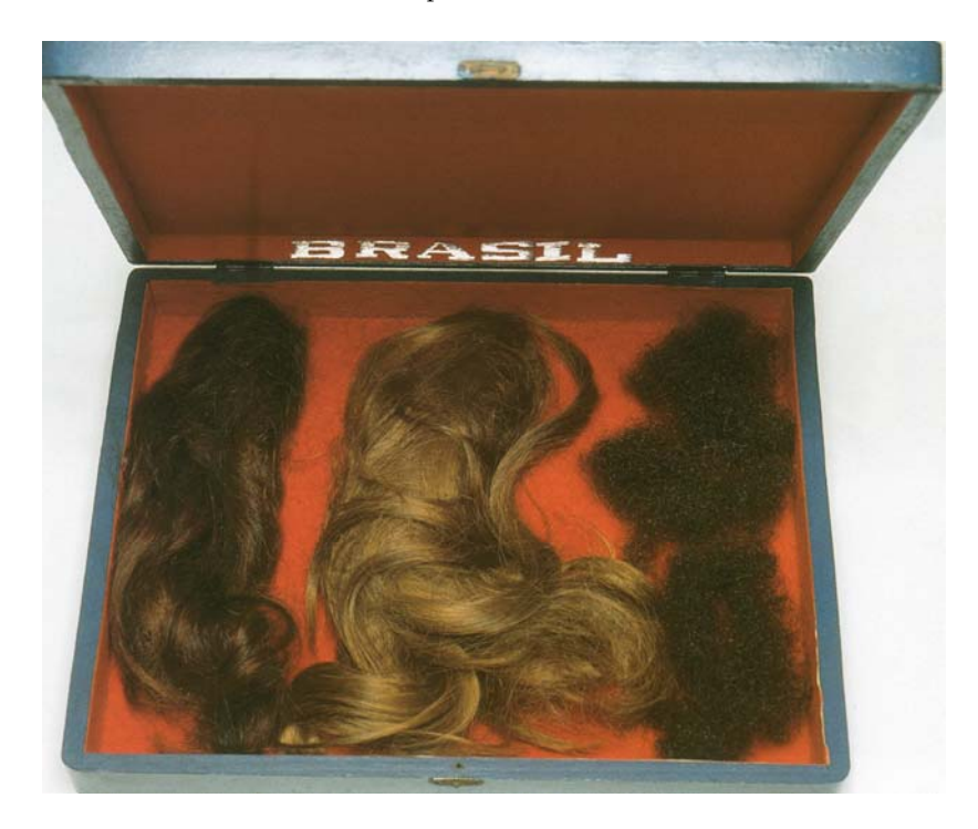
Lygia Pape Caixa Brasil , 1968 Velvet-lined wooden box and hair, 30 x 36 x 5 cm. Artist's collection

Collection Instituto de Arte Contemporânea, Lisbon