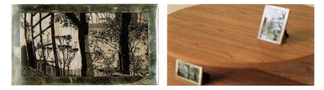
Three GIUSEPPE TERRAGNI cherry tree wood, side tables designed for the FEDERATION OF AGRICULTURE, NOVOCOMUM, Como, 1929, with: ARNE JACOBSEN: CYLYNDA LINE ashtray, Denmark, 1967; WILLIAM LESCAZE: Salt & Pepper Shakers (date unknown); ÁLVARO SIZA VIEIRA doorhandle, Oporto, Portugal, 1970's, designed to Quinta da Malagueira, Évora, 1977, fabricated by Carvalho Baptista & Ca Lda.; PEDRO SAMPAIO: ice container and tongs, Lisbon (date unknown); and with silver framed, silk & cotton petit point renditions of - ROSE SEIDLER HOUSE by HARRY SEIDLER, Turramurra, Sydney, 1951 (interior view); LAKEHOUSE FOR AN ARTIST by GIUSEPPE TERRAGNI - in collaboration with P. Lingeri, M. Cereghini, G. Giussani, G. Mantero. O. Ortelli, A. Dell'Acqua, C. Ponci - Milan V Trienal, 1933 (interior with the artists' studio viewed from the movable passageway); CASE STUDY HOUSE N0 8 (Eames House) by CHARLES AND RAY EAMES, Pacific Palisades, California, 1945-49 (reflections on interior glass walls); VILLA MAIREA by Alvar Aalto, Noormakku, Finland, 1937-39 (interior, main, staircase); UNIVERSAL CINEMA by ERICH MENDELSOHN, in conjunction with residence, Woga, Berlin, 1928 (interior view); FARNSWORTH HOUSE by LUDWIG MIES VAN DER ROHE, Plano, Illinois, 1950-51 (in flood conditions); PROJECT FOR JOSEPHINE BAKER HOUSE by ADOLF LOOS 1928 (model); POR TIMOR Library & Community Centre, renovation by TEOTÓNIO PEREIRA, Lisbon, 1992 (facade)