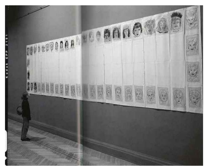
Pintura Aeropostal Nº 120, La XX Historia del Rostro (el Camino de Jope), 1997 Pintura, Bordado, Satén, Hilván y Fotoserigrafia sobre 6 Paños de Loneta Duck, 210 x 814 cm Itinerario: Santiago de Chile 97 – México D.F. 97 – Santiago de Chile 98 – Lisboa 98