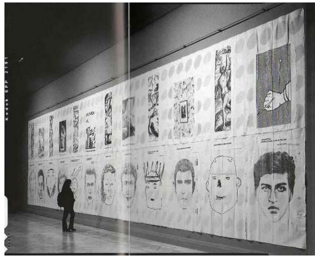
Pintura Aeropostal Nº 112, La Cocina y la Guerra, 1994 Pintura, Hilván y Fotoserigrafia sobre 12 Paños de Algodón, 210 x 1680 cm Itinerario: Santiago de Chile 94 – Madrid 94/95 – Nueva York 97 – Santiago de Chile 98 – Lisboa 98